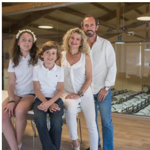
" La Familia"

Located on the "Golden Mile" in the town of Quintanilla de Onesimo near Bodegas Pingus and Arzuaga and only a few miles from famous Pesquera and Vega Sicilia. Vega de Yuso owns 24 hectares (60 acres) divided into 7 vineyards. All their vineyards are planted on steep hills above the valley floor, escaping the dangerous frost that force most wineries to harvest early. Pozo de Nieve Vineyards are about 25 years old and trellised. They were planted in clay rich soil at an altitude of 2,970 feet. Yields average 2.67 Tons per acre = 131 cases. Total production is 5,000 cases.