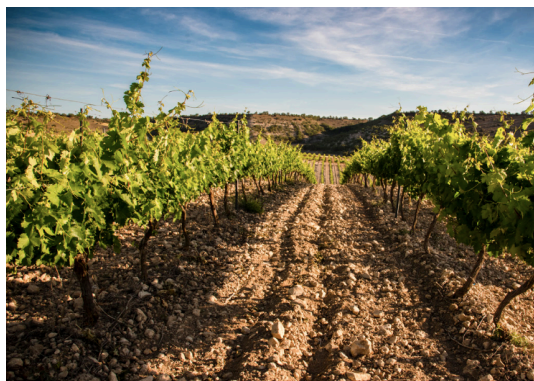
" High above the Valley Floor"