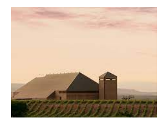
Guelbenzu, a Temple to Red Blends