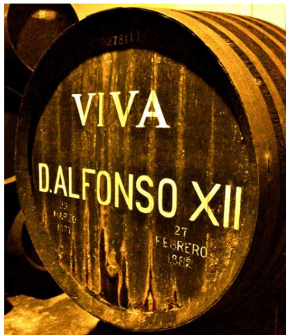
Bota dates back to 1872